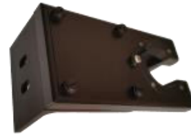
or Rail Mount system

Downrod with cone and coupler assembly: Solid downrod for 360 Systems